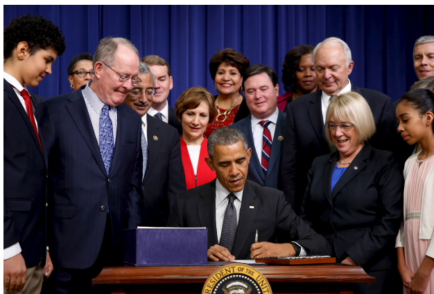
Above: President Obama signs the ESSA in 2015.